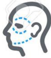
Facial Plastic Surgery